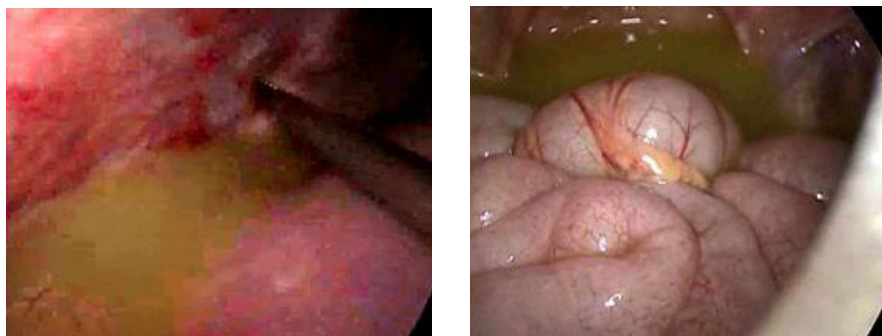
Figures 1–2. Intraoperative visualization of purulent effusion in the abdominal cavity resulting from the perforation of a liver echinococcal cyst. Fragments of the chitinous membrane are also visible

Surgical treatment commenced with diagnostic laparoscopy in all cases. Following the introduction of laparoscopic optics, the abdominal cavity was examined to determine the extent of the disease and establish intraoperative strategy. ECs appeared as round, whitish formations protruding from the liver surface. During diagnostic laparoscopy, the cysts' location was identified, and additional working trocars were placed depending on their positioning. Instrumental palpation revealed that ECs were denser than liver tissue. Adhesions between the Glisson capsule and diaphragm, as well as between the cyst's fibrous membrane and the greater omentum, served as indirect signs of cyst localization.